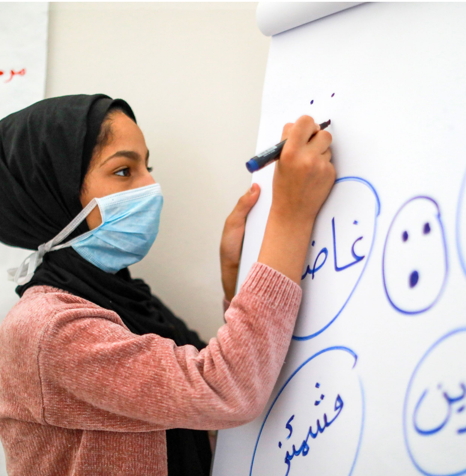
A girl takes part in a life skills education activity in the Gaza Strip, State of Palestine.